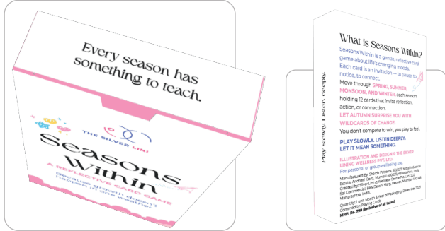
ADDITIONAL ORIENTATION VIEWS